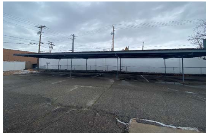
Rear of property, facing east