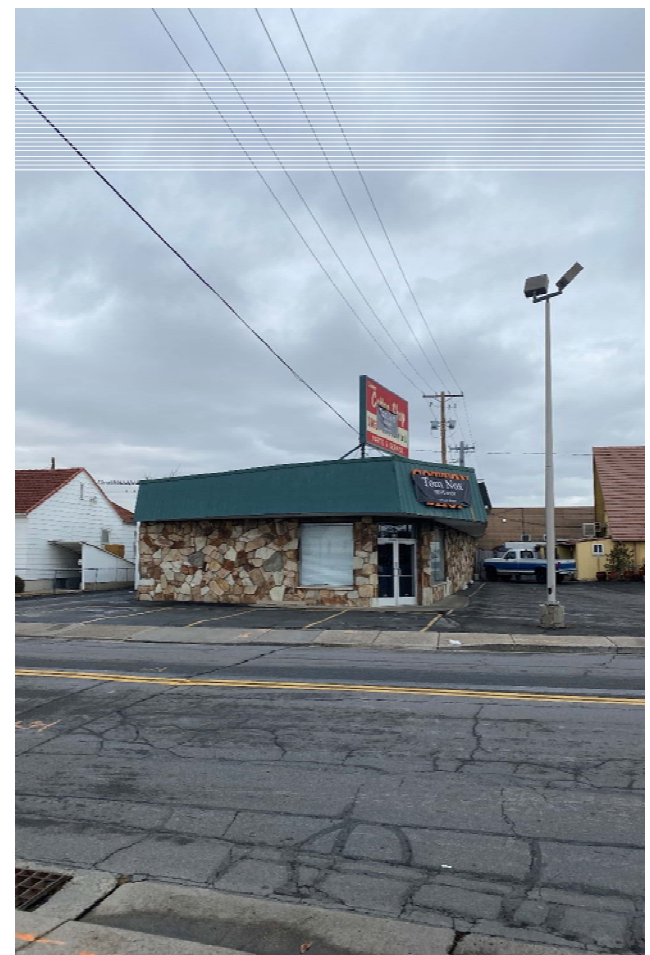
Cotton Shop, facing north 6100 South State Street