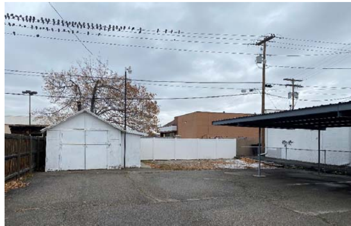
Rear of property, facing northeast