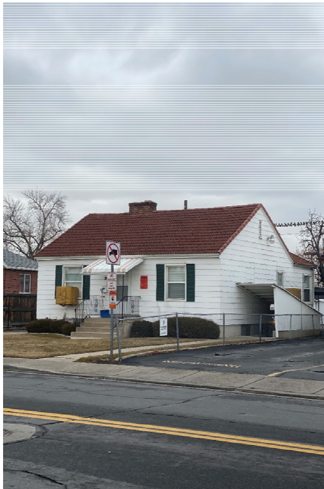
Subject property, facing northwest 61 East 6100 South