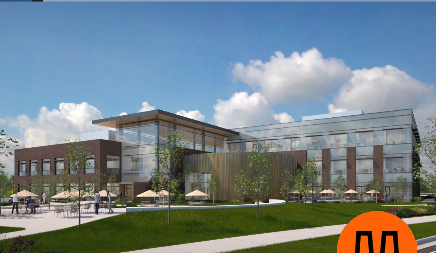
Photo: The Rendering for the Future New Murray City Hall